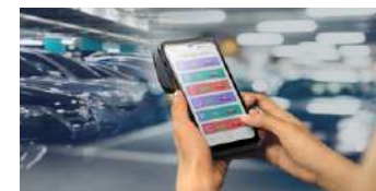
Parking Management and receipt printing