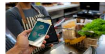
Supermarket Scanning and payment with SOFTPOS