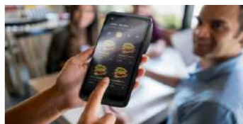
Restaurant food order take away & Queue