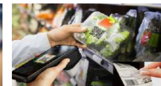
Supermarket price updating

EO&E: Product information and specifications are subject to change without prior notice