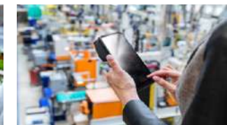
Warehouse Inspection and recording