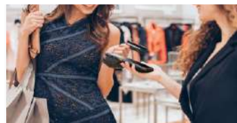
Retail Payment with SOFTPOS Regional support

Design Stage Estimated Launch Date Q2 2023